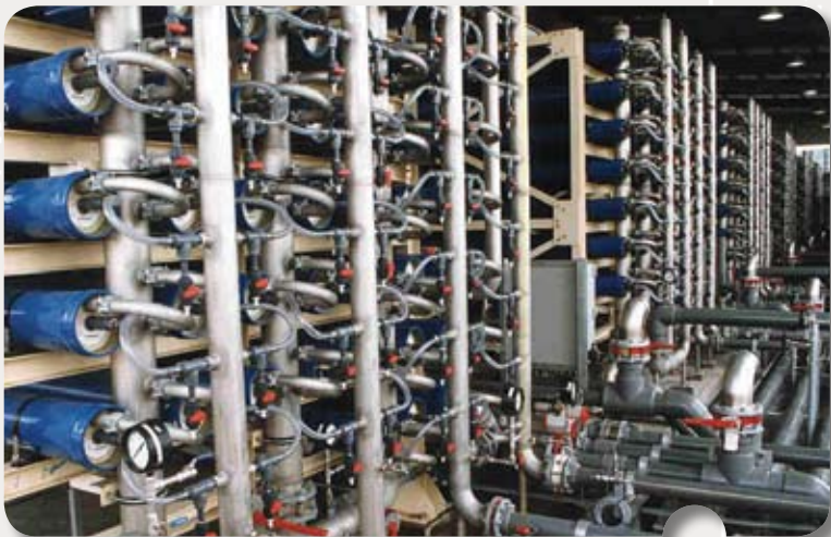
30,000 M 3 /Day Reverse Osmosis Installation

Aquatech is a global leader in water purification technology for the world's industrial and infrastructure markets, with a focus on desalination, water reuse and zero liquid discharge.