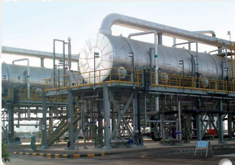
This 10,000 M 3 /Day MED Plant, at Aramco's Rabigh Refinery, is Saudi Arabia's first industrial BOOT project.