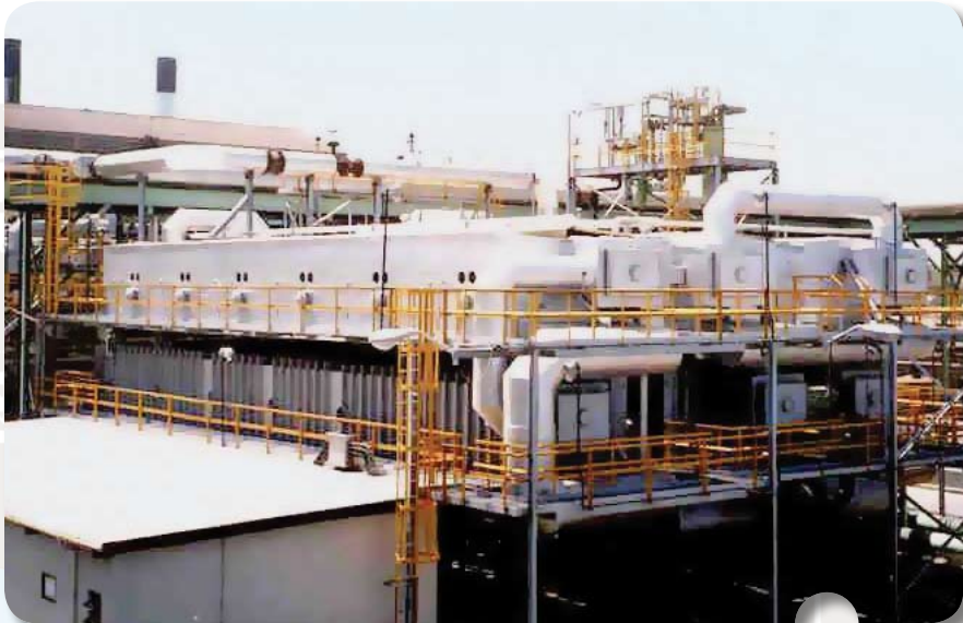
At 11.2 MGD, this Multi Stage Flash installation on the island of Aruba is one of the largest in the Caribbean and guarantees quality water for all the island's needs. In fact, Aruban drinking water has been dubbed "the champagne of the Caribbean," and is even bottled and shipped to nearby Curacao.