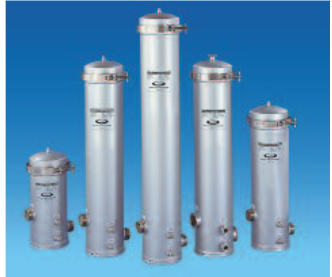
MC Series Multi-Cartridge Filter Housings

316L stainless steel compression seat plate assemblies and tube guides are included with the MC Series