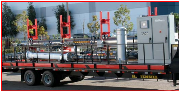
16"x60" Membrane Application

AMI welcomes the opportunity to work with you to fulfill your specific filtration needs.