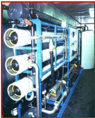
Portable Water Purification