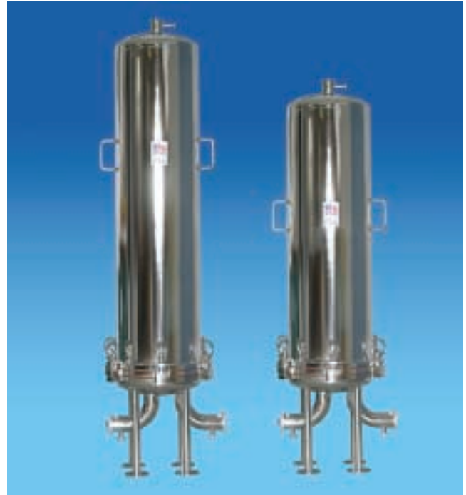
SHP Series Sanitary Filter Housings