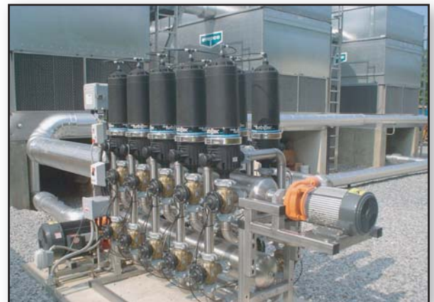
10-Pod, 800 GPM Side-Stream System, complete with Main Pump and Booster Pump