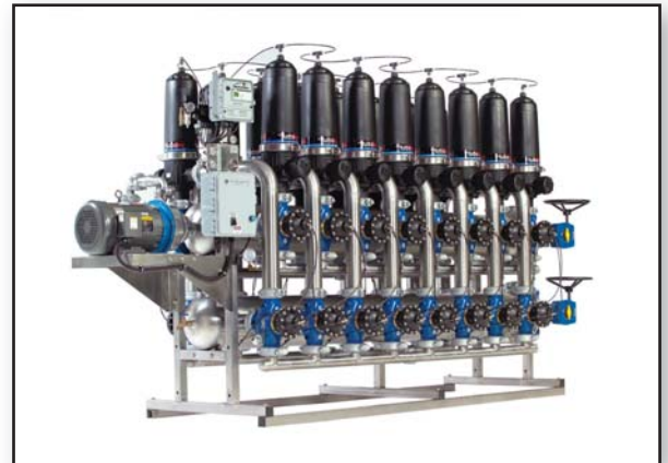
16-Pod, 1,600 GPM Full-Stream System, complete with Booster Pump