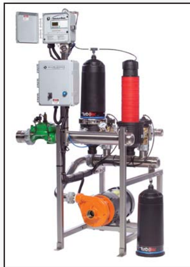
2-Pod Side-Stream System, complete with 150 GPM Pump