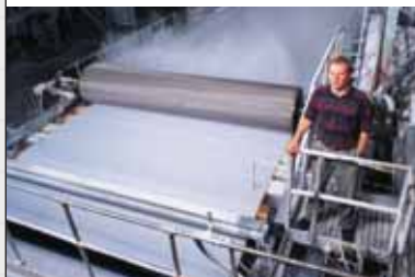
Energy efficiency has resulted in reduced CO 2 emissions (650 tons per year)