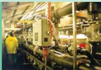
Pre snow gun water polishing at ski resort in Australia. Water supply from local storage dam.